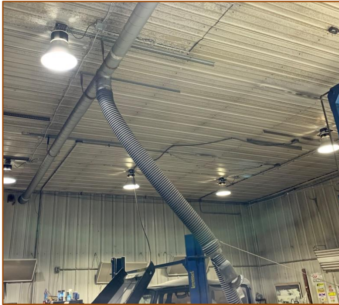
Ventilation System In Warehouse